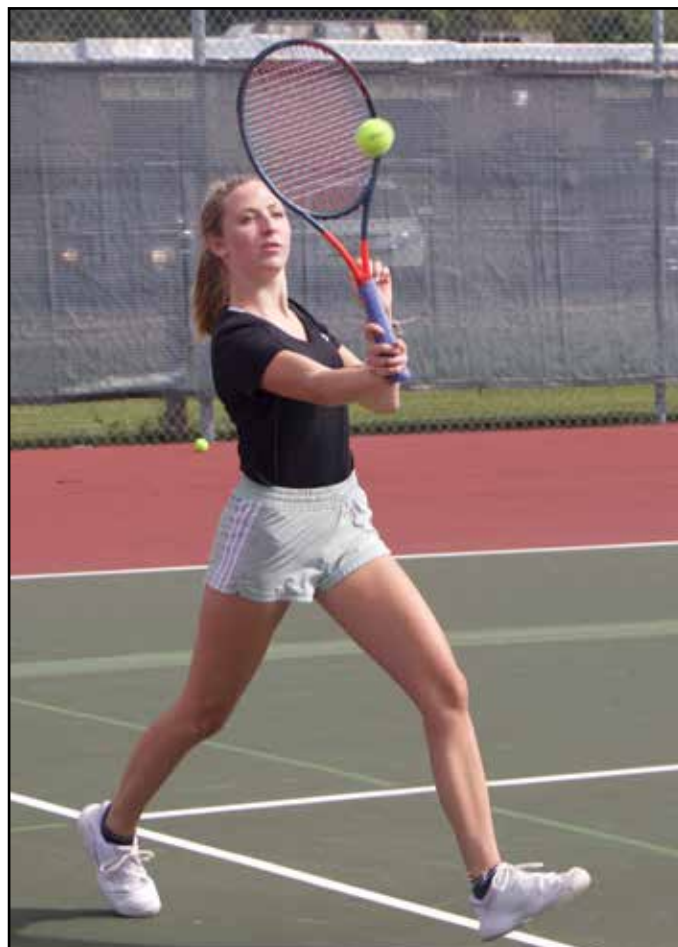
Action from the Staples-Motley tennis team's first week of practice.